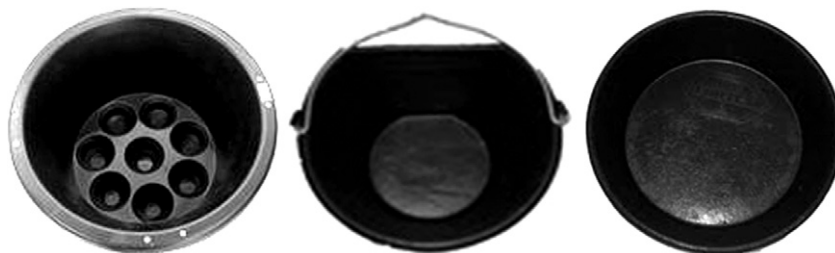
Fig. 1. Overhead view of the cup (Pre-Vent), bucket, and tub feeders (not to scale).

compared with the cup feeder under controlled conditions to determine whether the cup design provided an advantage over the two commonly used conventional horse feeders.